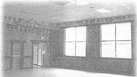
January 5, 2011