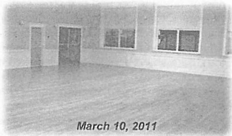
March 10, 2011