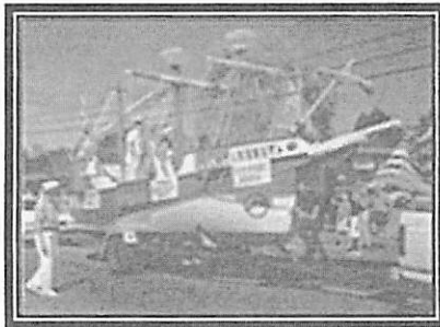
d'Esterre House's entry in a 1990s Nautical Day's parade